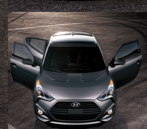
VELOSTER TURBO in Matte Gray