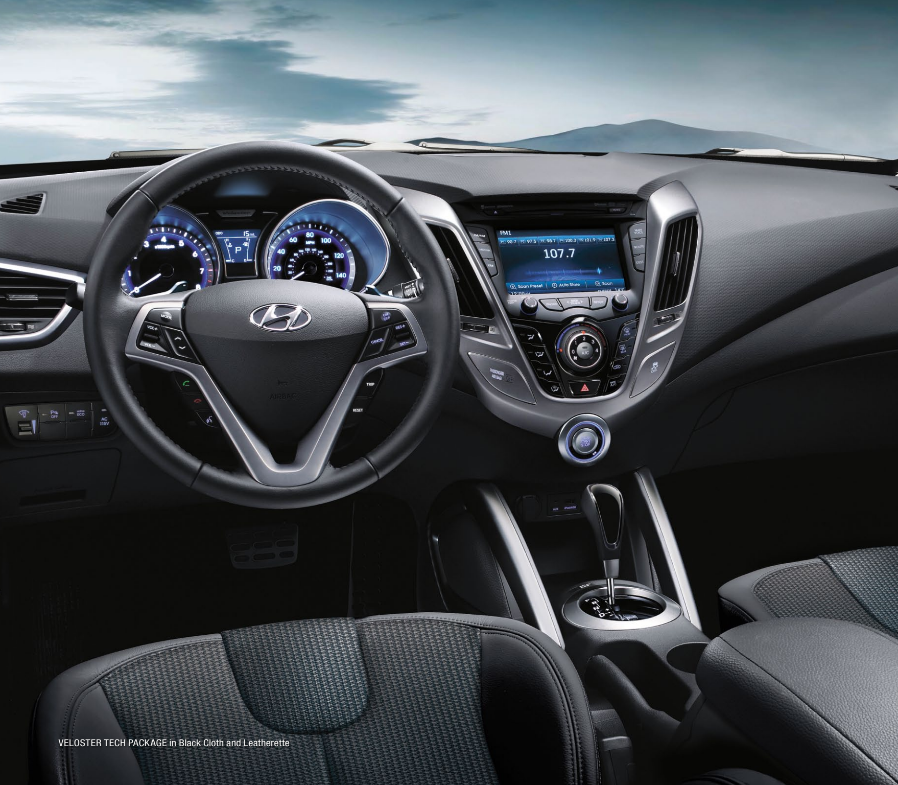
VELOSTER TECH PACKAGE in Black Cloth and Leatherette